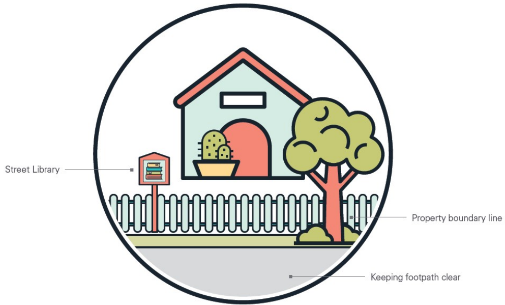
Figure 1 – Indicative street view of street library placement.