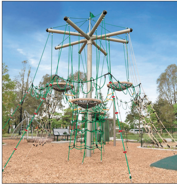
Eagles nest rope climb (neutral coloured ropes to be installed)