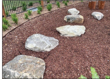
Sandstone stepping stones