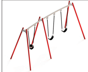
3 way swing set (neutral colour tbc)