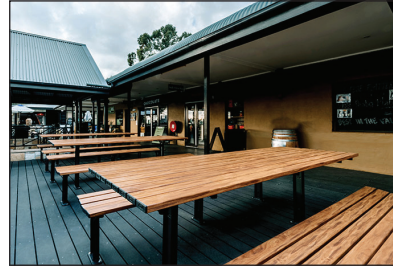
Timber look aluminium picnic setting