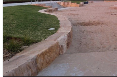
Informal sandstone seating