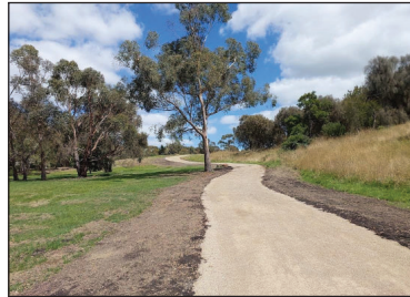
Crushed sandstone footpath