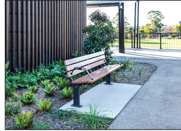
Timber look aluminium park seats