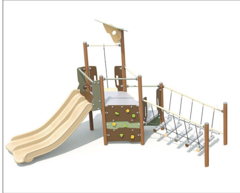
Double slide with rope bridge