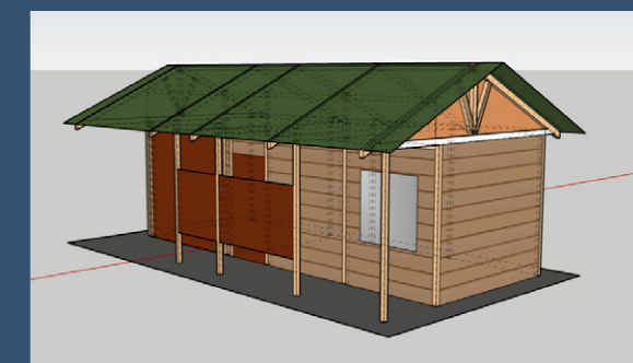
Indicative render of office and storeroom