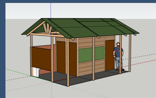
Indicative render of amenities building