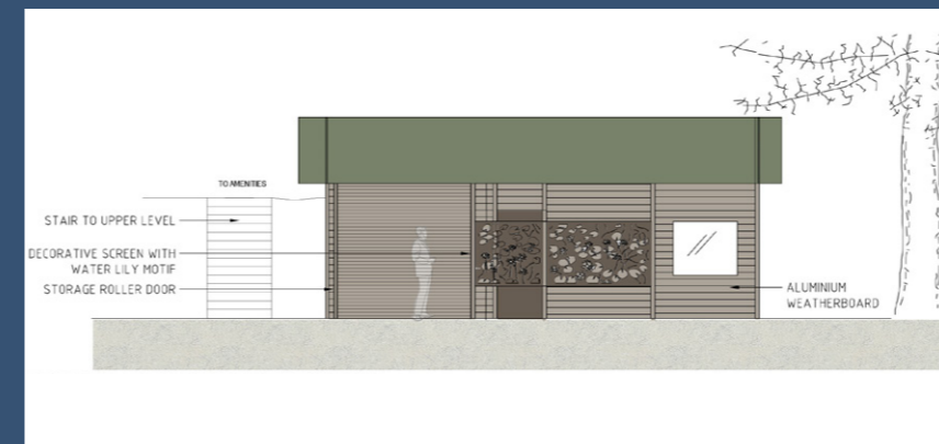
Front Elevation - office and storeroom