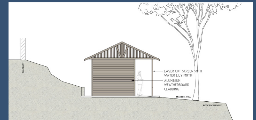
Side Elevation - office and storeroom