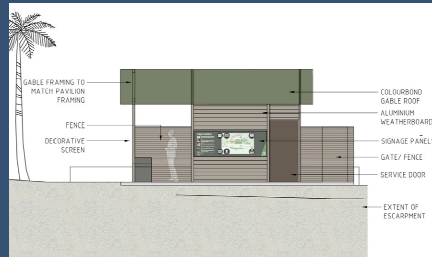
Front Elevation - amenities building