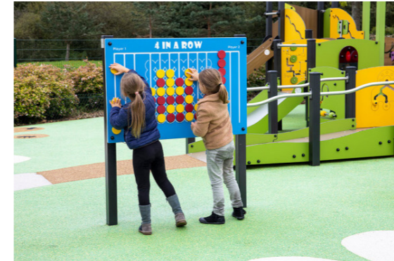
Inclusive play panels