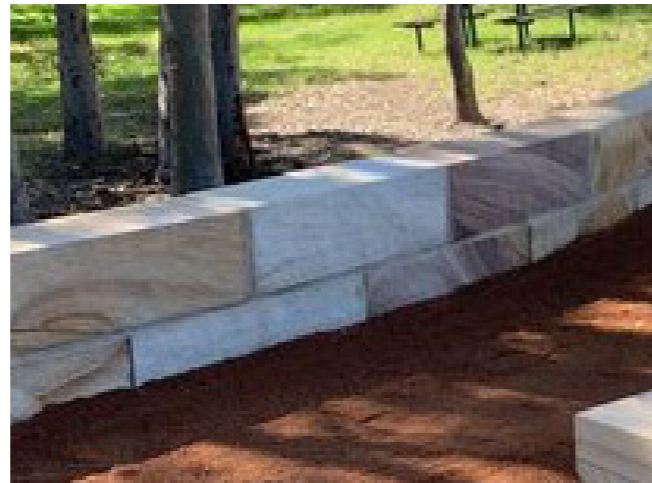
Sandstone logs for retaining & informal seating