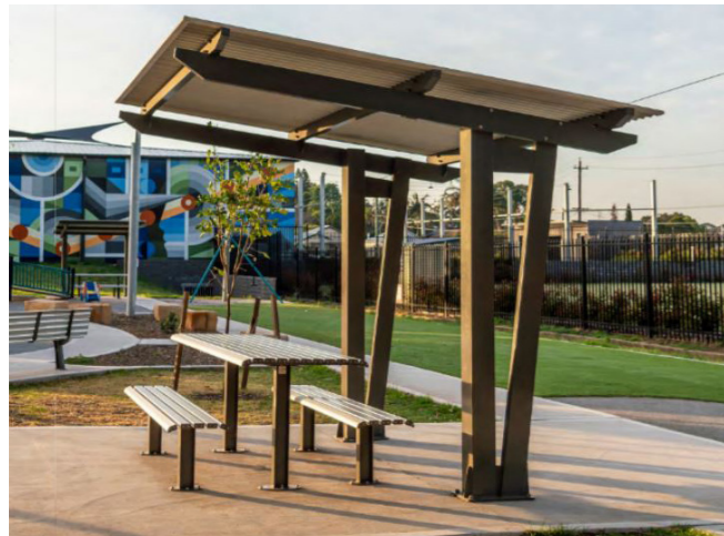
Shelter with picnic setting