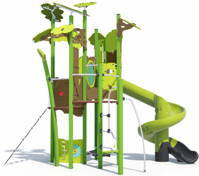
Play tower with slide