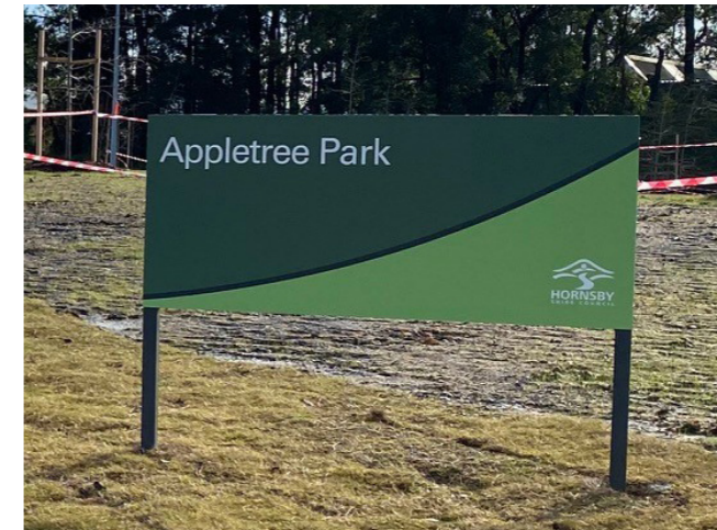
New park sign