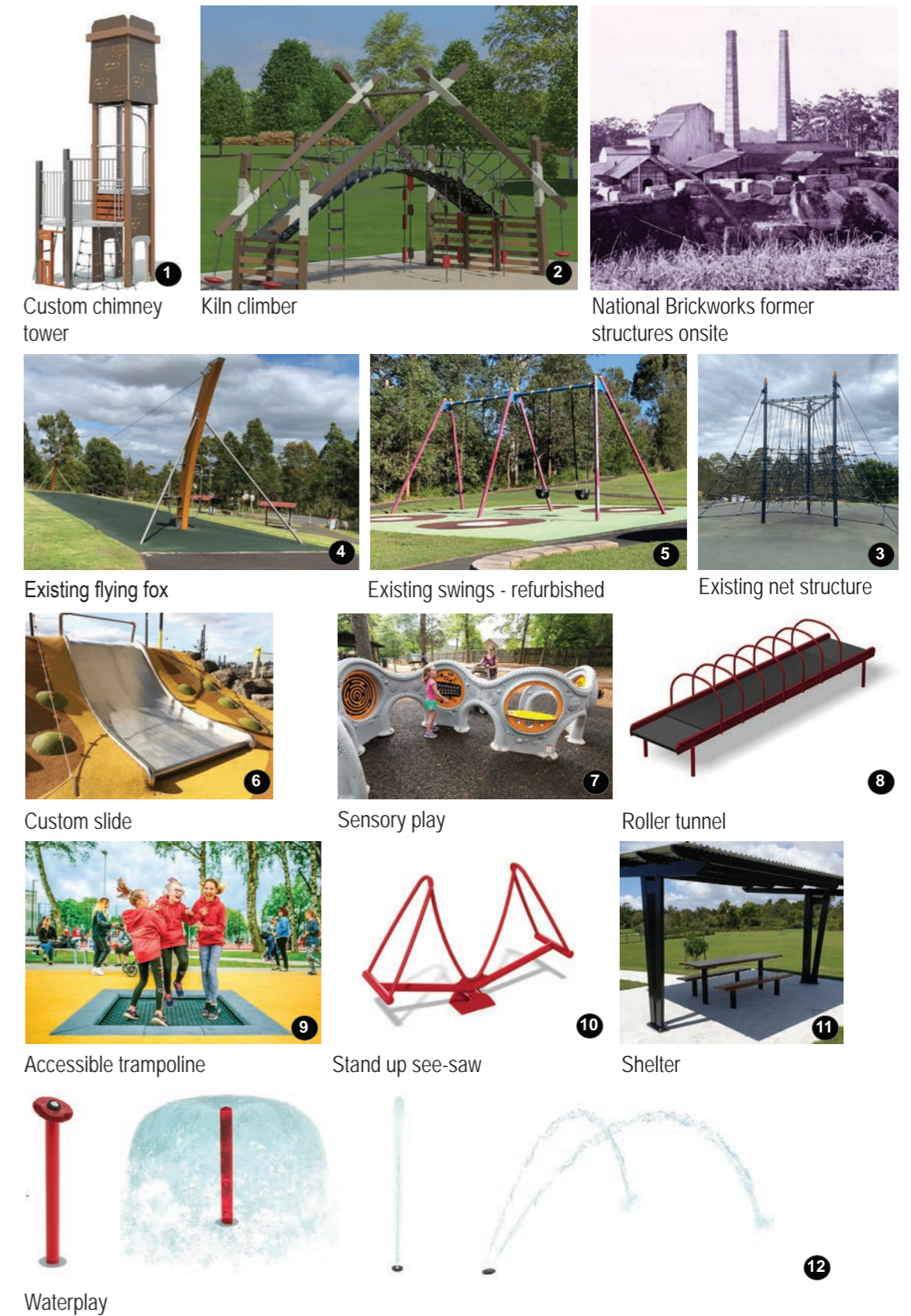
Custom chimney tower