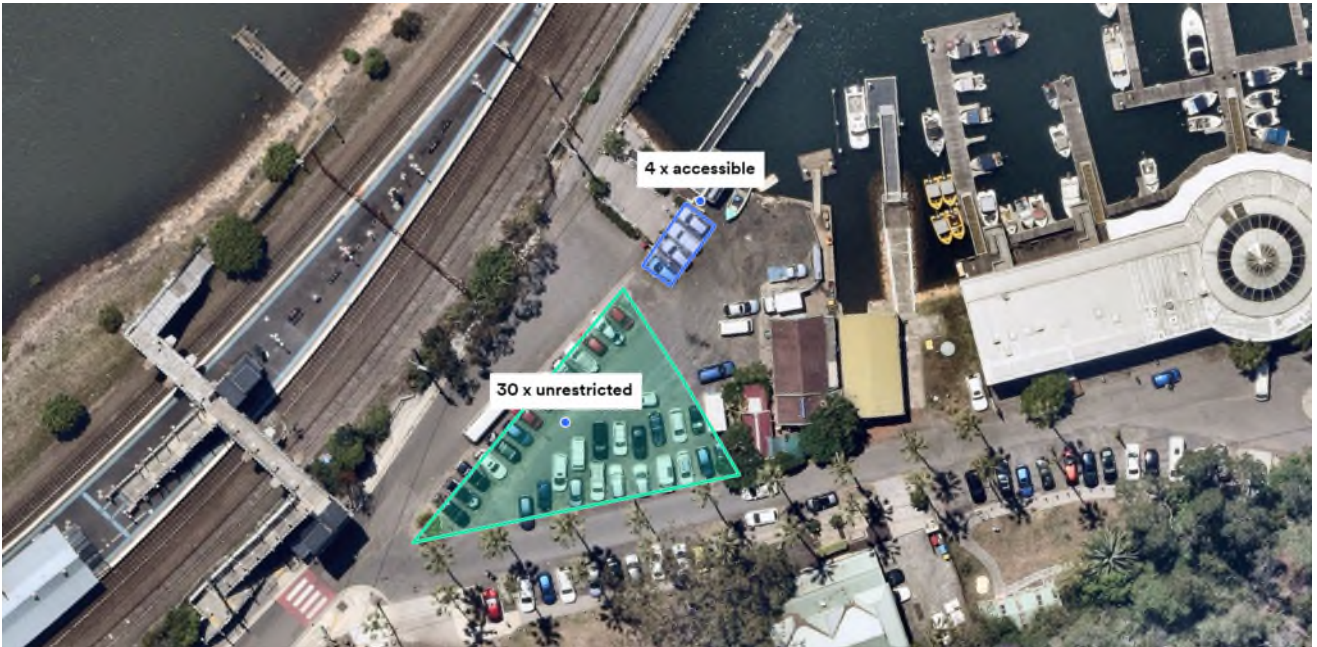
Dangar Road Carpark, Brooklyn