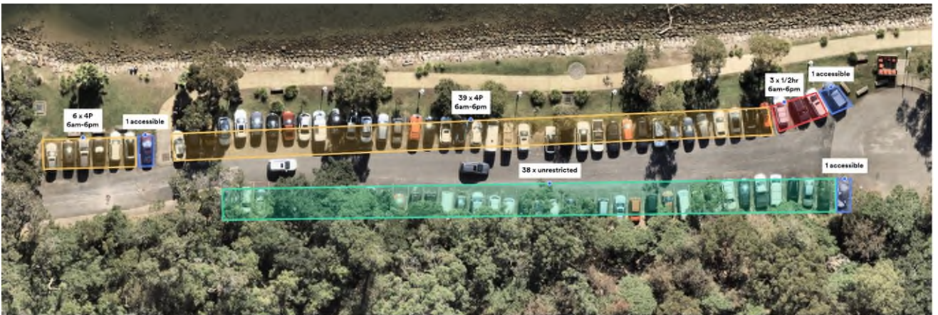
Lower McKell Park, Brooklyn